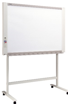
Copyboard with an optional stand.