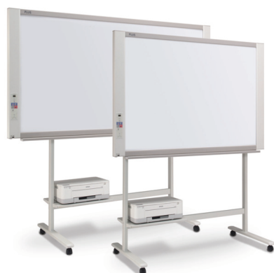
Copyboards with optional printers and stands.

Secure your meeting information speedy and safely!